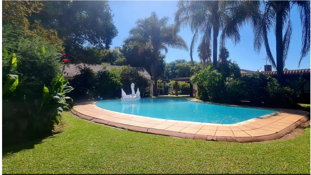
Web Ref RADV-12036