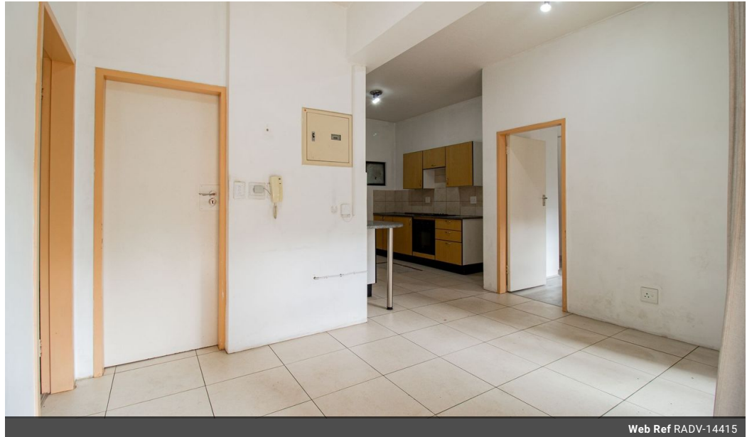
Web Ref RADV-14415