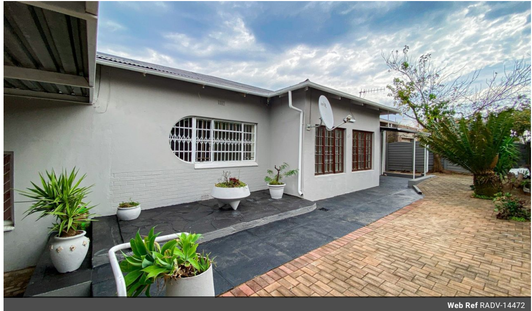
Web Ref RADV-14472