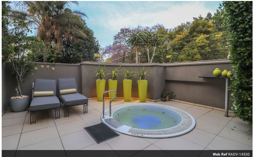
Web Ref RADV-14530