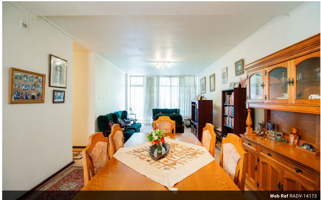
Web Ref RADV-14173