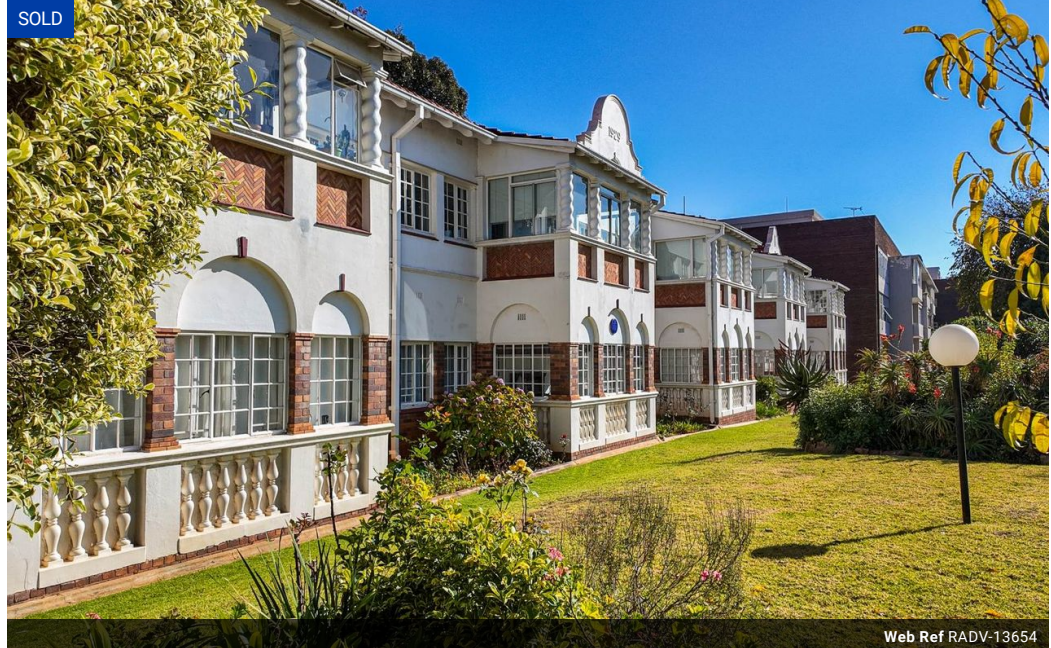
Web Ref RADV-13654