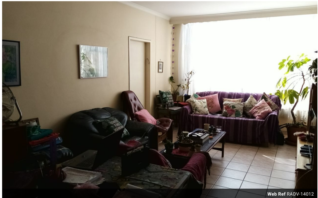
Web Ref RADV-14012