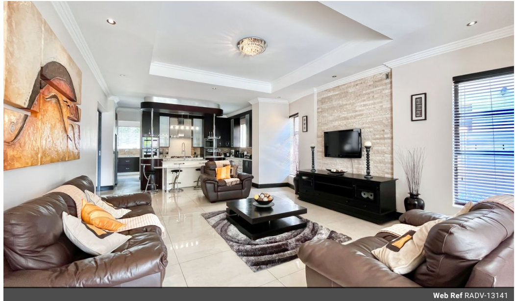
Web Ref RADV-13141