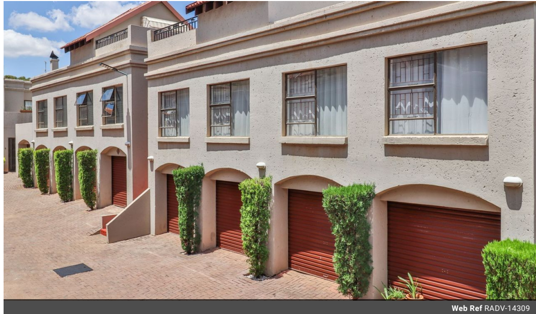
Web Ref RADV-14309