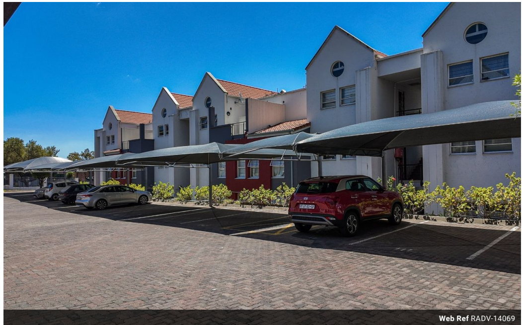
Web Ref RADV-14069