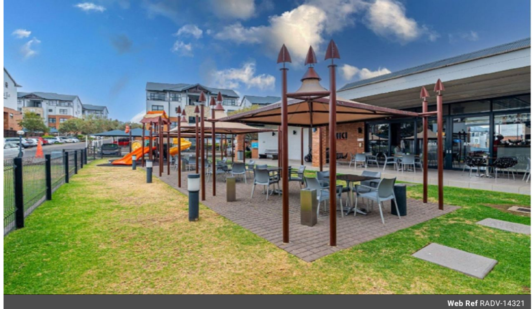
Web Ref RADV-14321