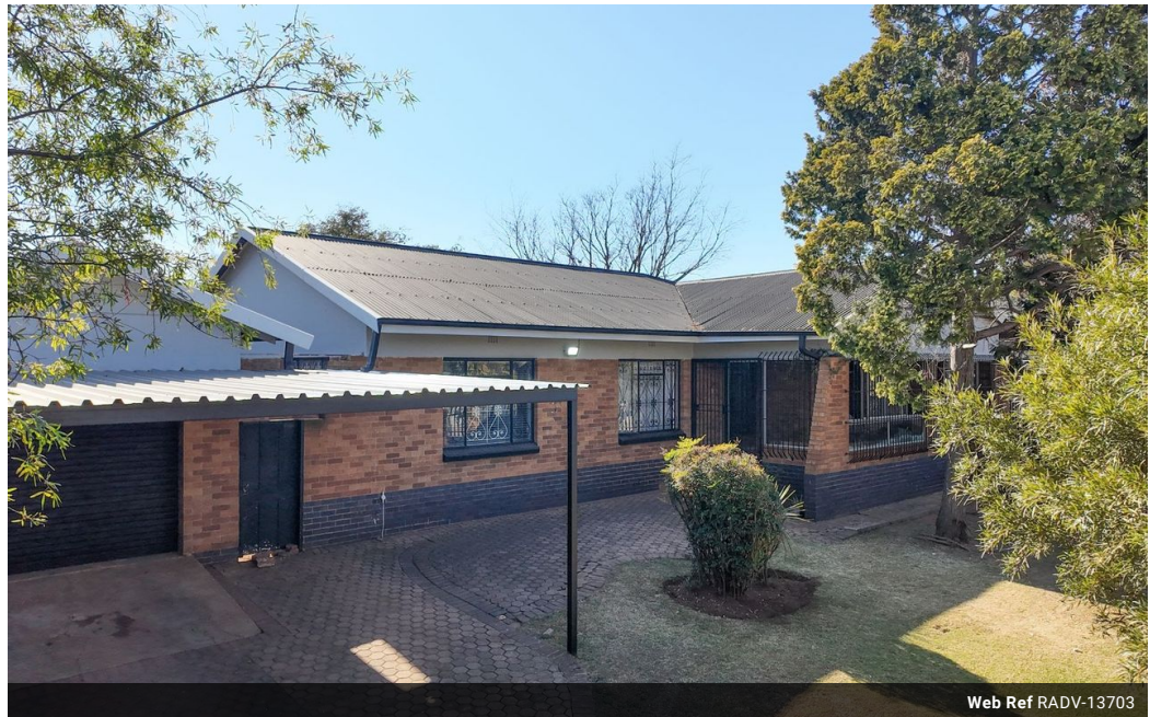
Web Ref RADV-13703