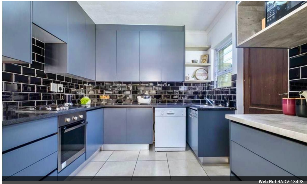
Web Ref RADV-13498