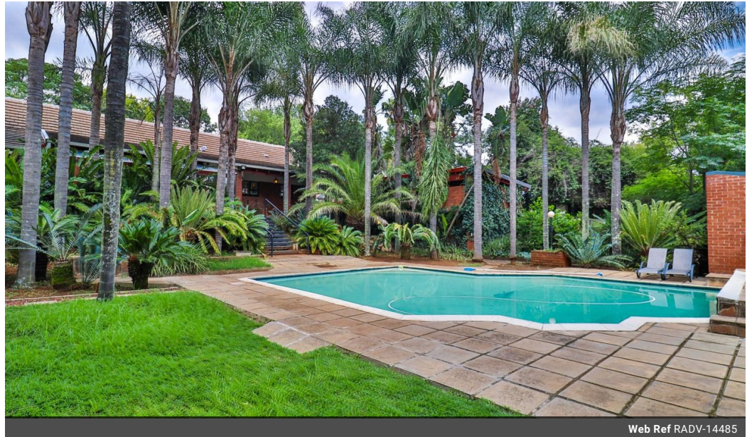
Web Ref RADV-14485