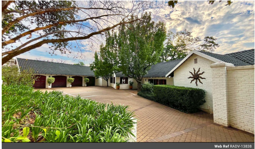
Web Ref RADV-13838