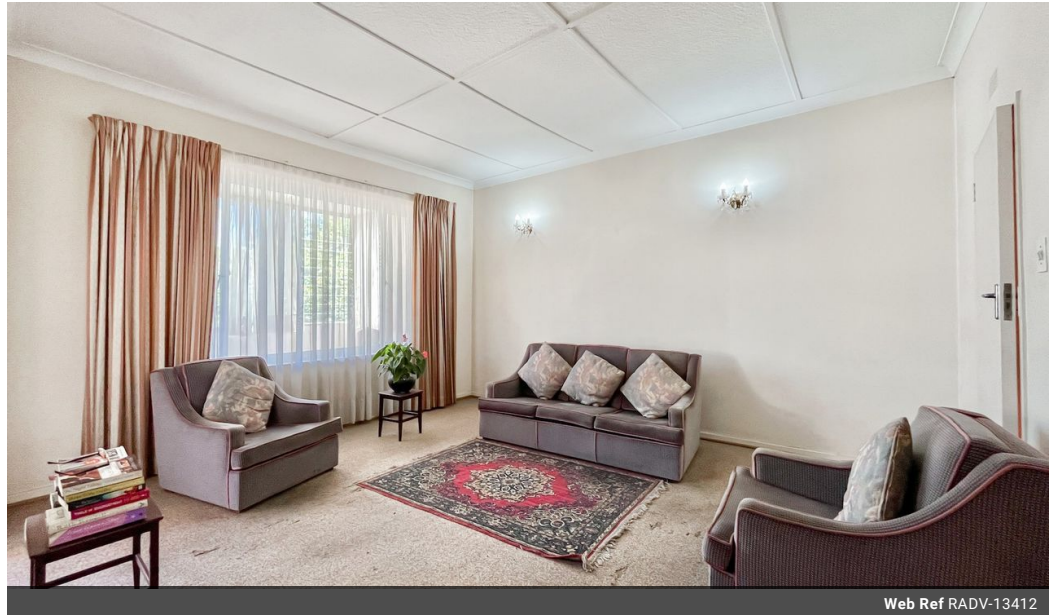
Web Ref RADV-13412