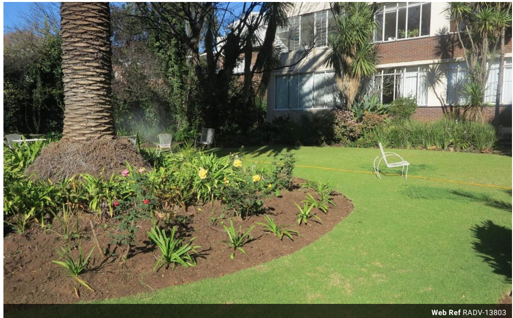
Web Ref RADV-13803