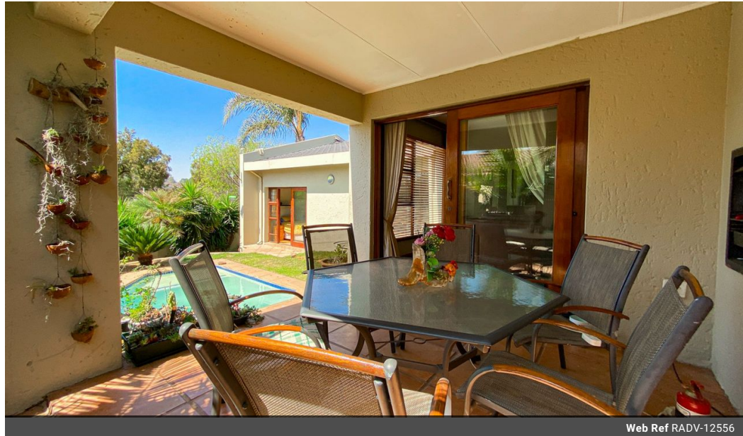
Web Ref RADV-12556