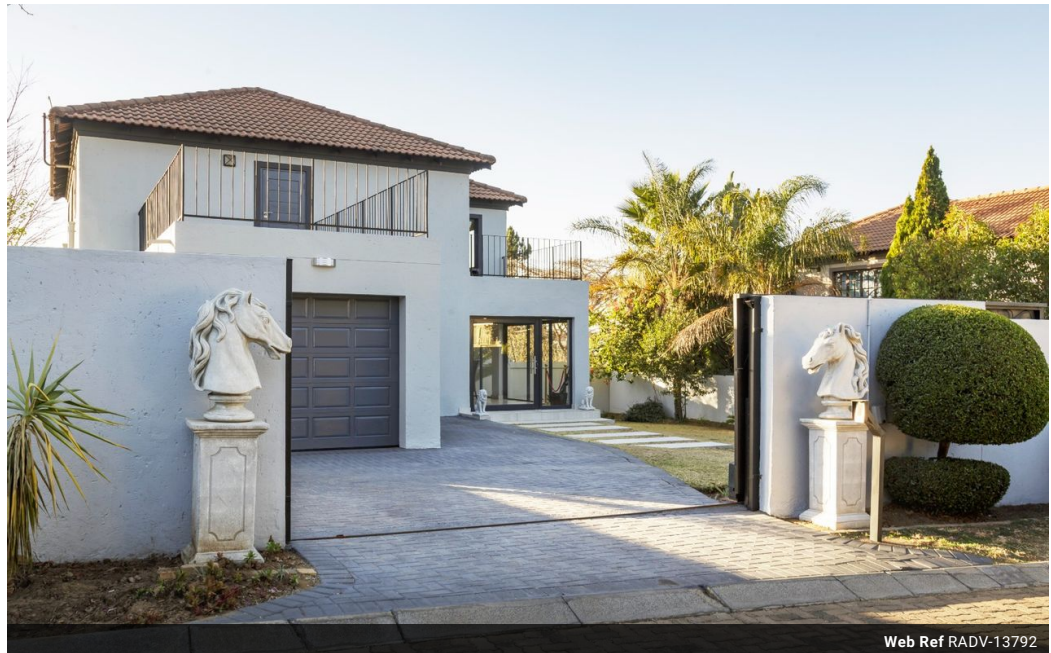
Web Ref RADV-13792