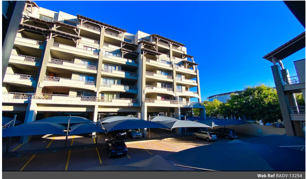
Web Ref RADV-13254