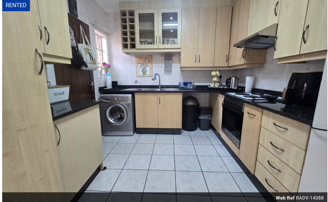
Web Ref RADV-14088