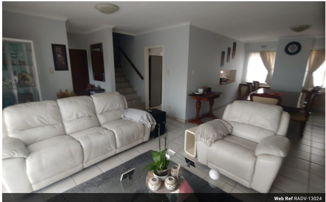
Web Ref RADV-13024