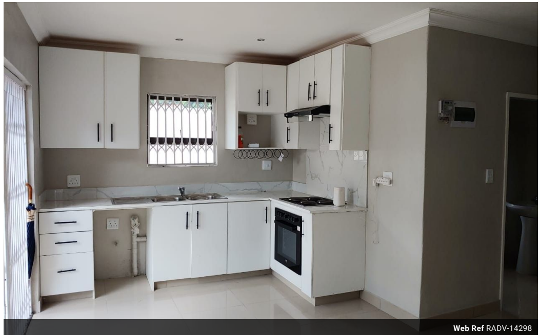
Web Ref RADV-14298