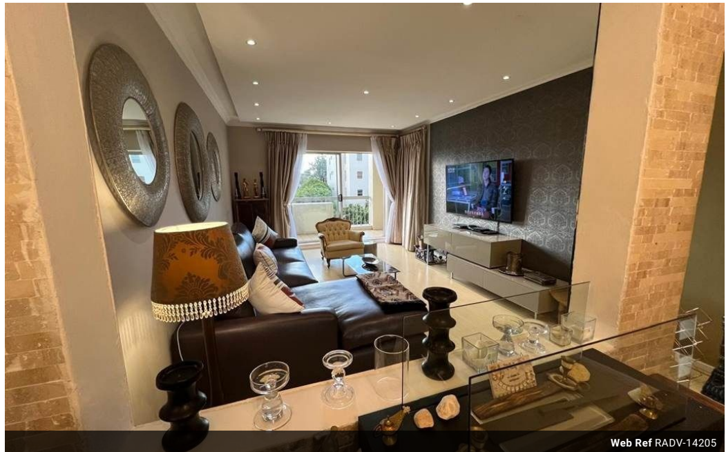
Web Ref RADV-14205